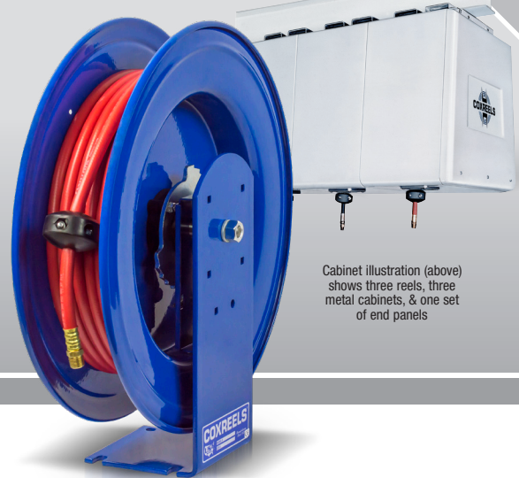
Cabinet illustration (above) shows three reels, three metal cabinets, & one set of end panels